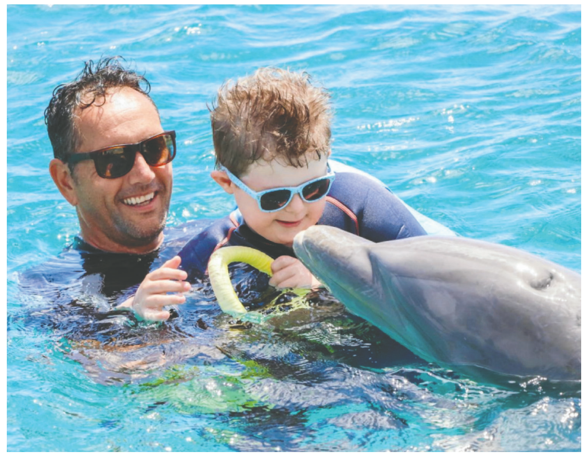
Patients with special needs can frolic with new friends at the Curação Dolphin Treatment Center in the Caribbean.

the guest rooms. The new wing, opening this summer, is a vision of tropical decor indoors with the added attraction of outdoor terraces and corridors that let in natural